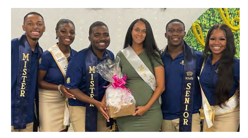
During the triad and surrounding region baby shower in Greensboro, a new mom was showered by volunteer students from North Carolina Agricultural & Technical State University. Go Aggies!

Our baby showers offer us a chance to celebrate the arrival of these new babies and to encourage moms to get the prenatal and postpartum care they need. We offered dietary and general health information, early childhood development and education tips, and information about immunizations and wellness checks. We also shared discussions around breastfeeding, sleep, and car seat safety. In similar fashion, we met moms and families at our Greenville Wellness & Opportunity Center in October. Stay tuned to the 2024 calendar of events on our community webpage for future baby showers near you.