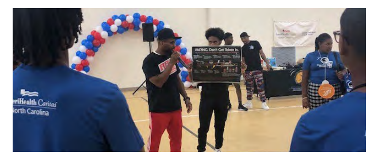
ACNC sponsored a signature Healthy Hoops event with the Thomasville Housing Authority in July, combining a basketball clinic with health education for young people.