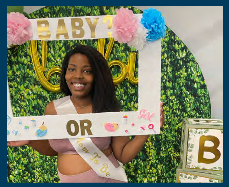
This new mom frames her smile and baby bump during the Greensboro baby shower at the Wellness & Opportunity Center.

What is a shower without goodies? Free portrait-sittings and resources were a big hit with members and guests who attended the baby showers at both the Greensboro and Greenville Wellness & Opportunity Centers.